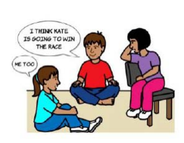
Share Thoughts and Ideas