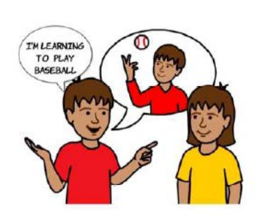
Share Personal Experiences